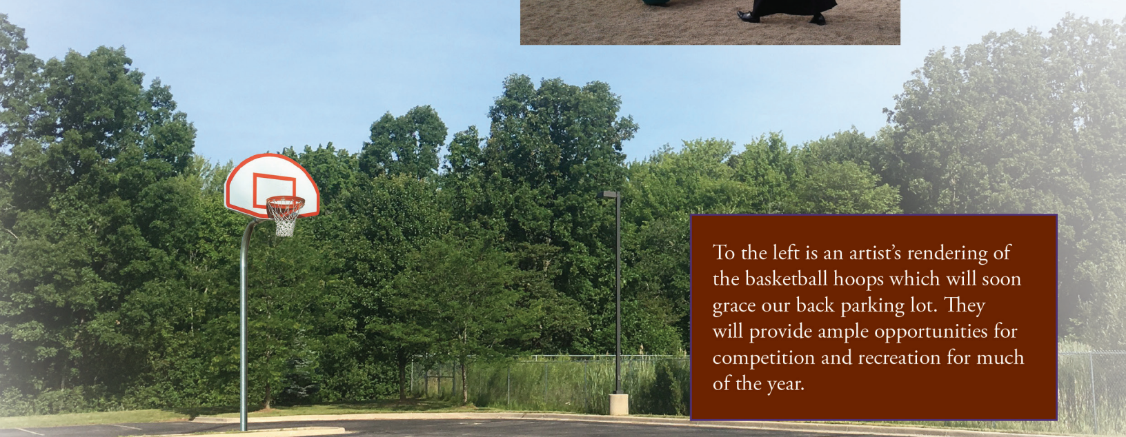
To the left is an artist's rendering of the basketball hoops which will soon grace our back parking lot. They will provide ample opportunities for competition and recreation for much of the year.