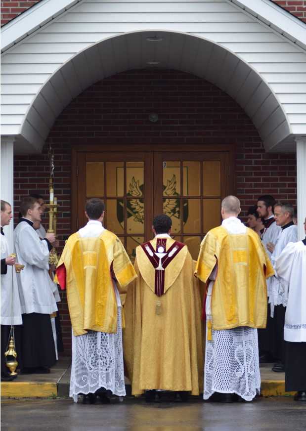
Clergy, servers, and students pause outside the doors of the new academy during the school blessing ceremony.