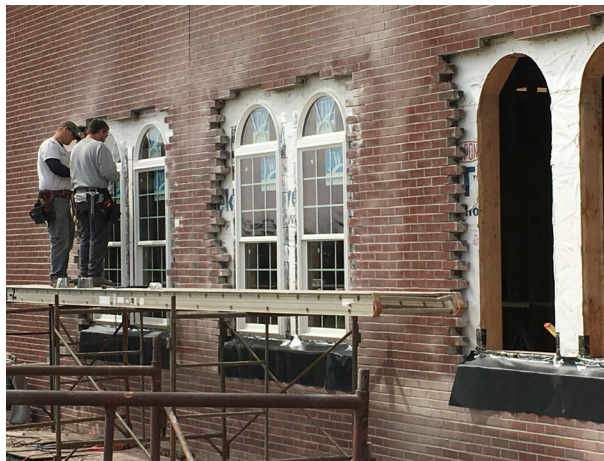
New windows added on the south side of the academy building will let in much-needed light and meet local fire codes.