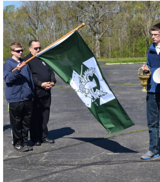
The new school banner is blessed by the Principal at the start of the 18th annual Rollerblade-a-Thon fundraiser.