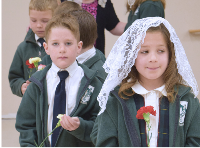
On the day of the blessing, the first communicants brought flowers for Our Lady.